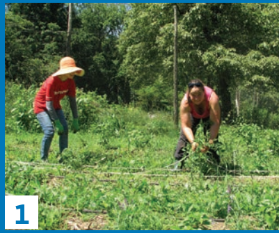
1 Allison and WLT volunteers plant, weed and water the Sugar Hill Farm garden.