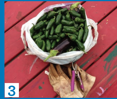
3 Together, they load up their cars and drop off the delivery to CCNW.