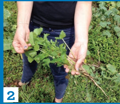
2 Allison and the volunteers harvest produce and wash off soil and debris.