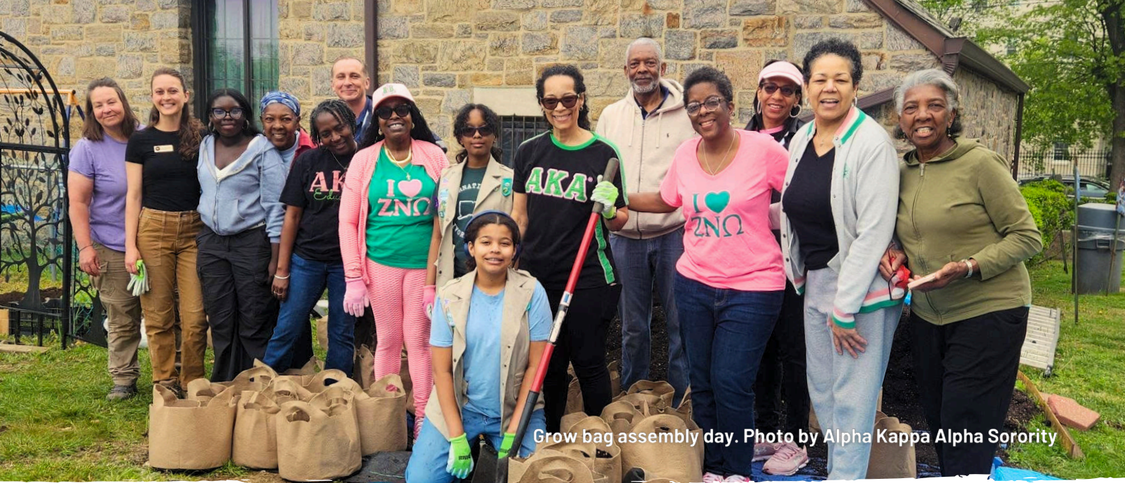
Grow bag assembly day.