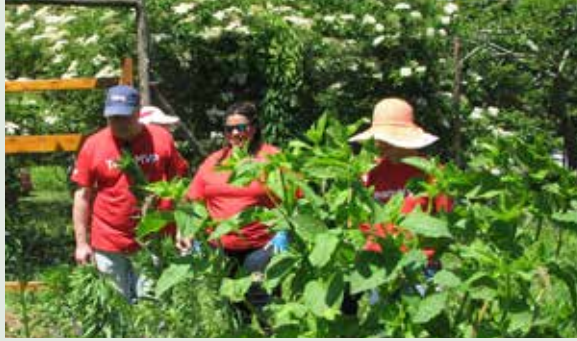
Employees from Team MVP spent an afternoon caring for our garden at Sugar Hill Farm. All harvested fruits and veggies will be donated to the Community Center of Northern Westchester.