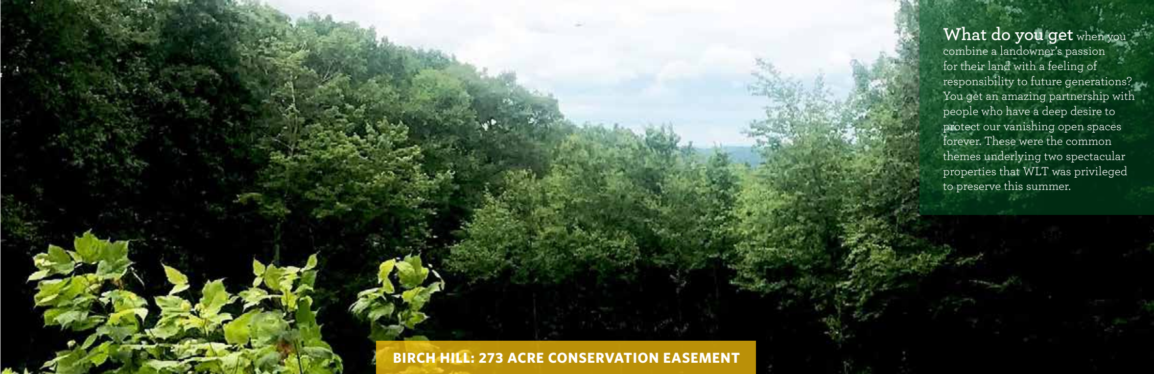
BIRCH HILL: 273 ACRE CONSERVATION EASEMENT

What do you get when you combine a landowner's passion for their land with a feeling of responsibility to future generations? You get an amazing partnership with people who have a deep desire to protect our vanishing open spaces forever. These were the common themes underlying two spectacular properties that WLT was privileged to preserve this summer.