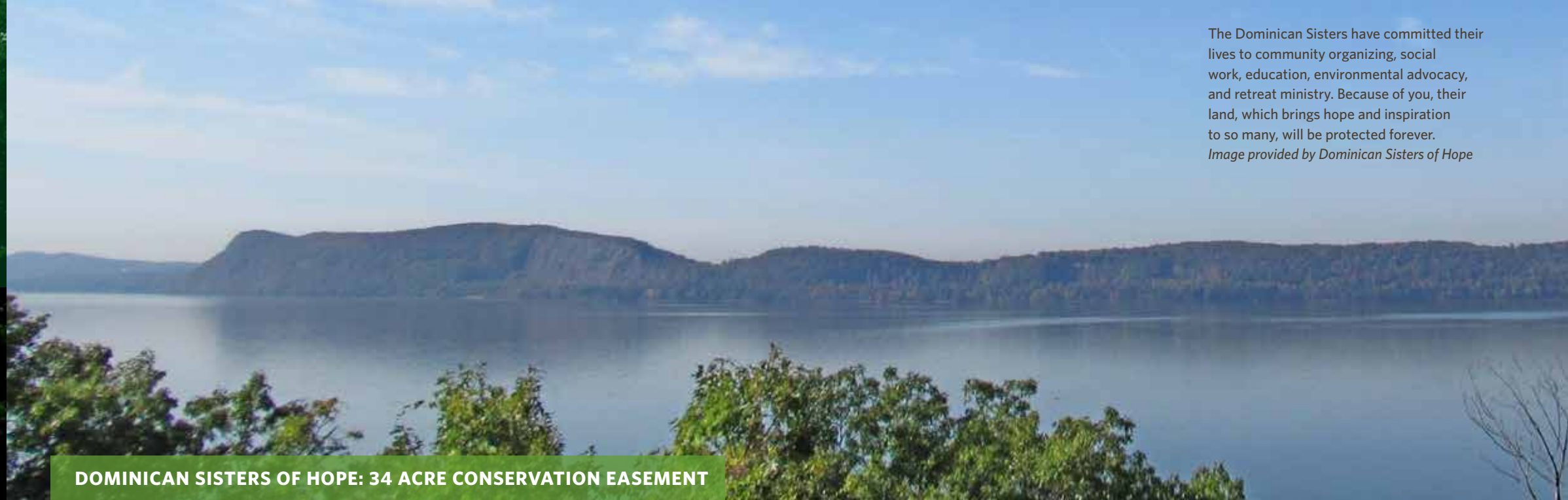
DOMINICAN SISTERS OF HOPE: 34 ACRE CONSERVATION EASEMENT

What do you get when you combine a landowner's passion for their land with a feeling of responsibility to future generations? You get an amazing partnership with people who have a deep desire to protect our vanishing open spaces forever. These were the common themes underlying two spectacular properties that WLT was privileged to preserve this summer.