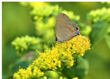
Fireworks goldenrod Solidago rugosa 'Fireworks'