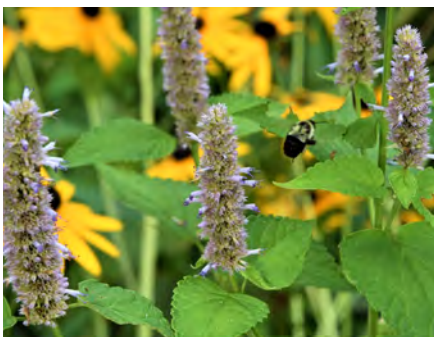
Anise hyssop Agastache foeniculum