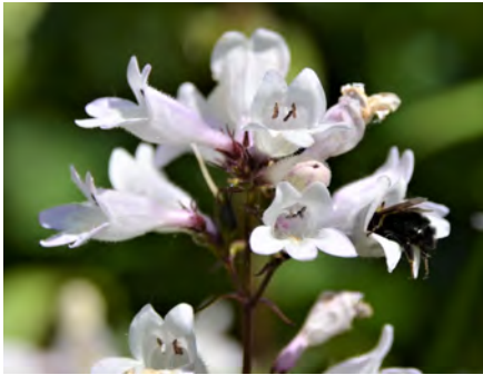
Foxglove beardtongue Penstemon digitalis

Beautiful, deer-resistant bee and butterfly favorites! Compact enough for smaller gardens, low-maintenance once established, and tough enough for urban conditions. For medium/dry soils.