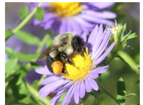
Aromatic aster Symphotrichum oblongifolium