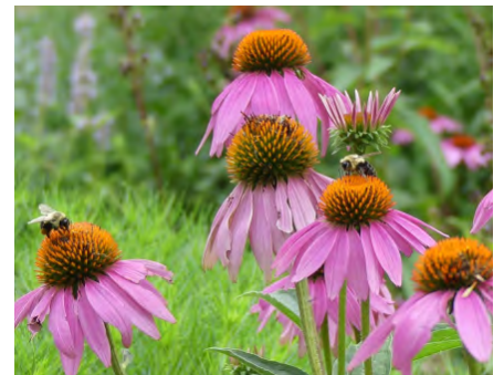
Coneflower Echinacea purpurea