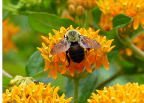
Butterfly weed Asclepias tuberosa