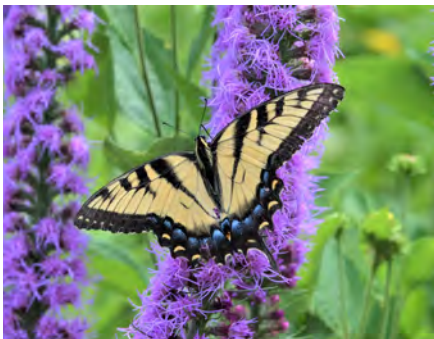
Blazing star Liatriis spicata