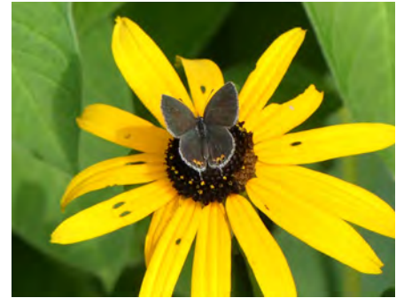
Black-eyed Susan Rudbeckia fulgida